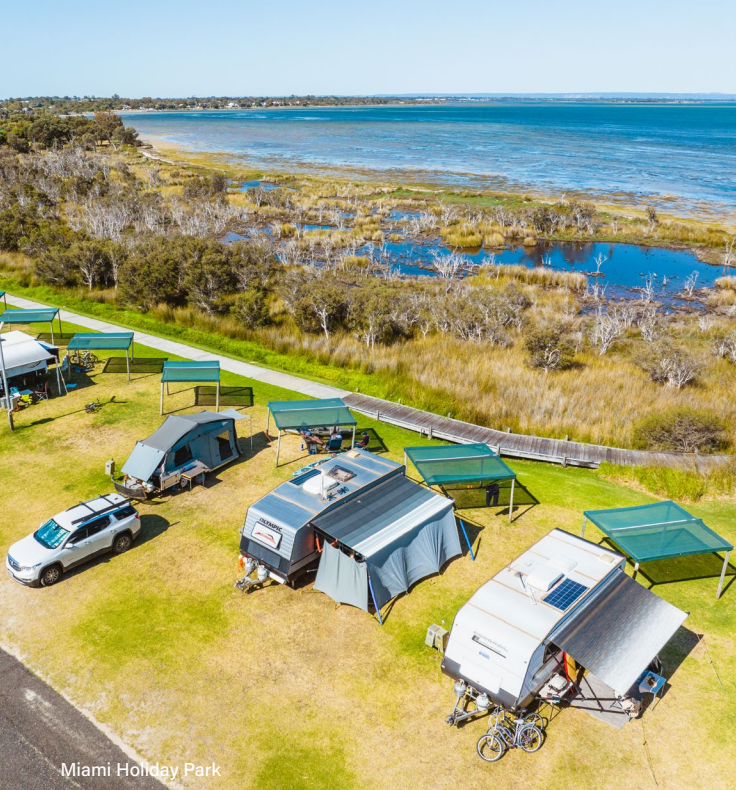
Miami Holiday Park