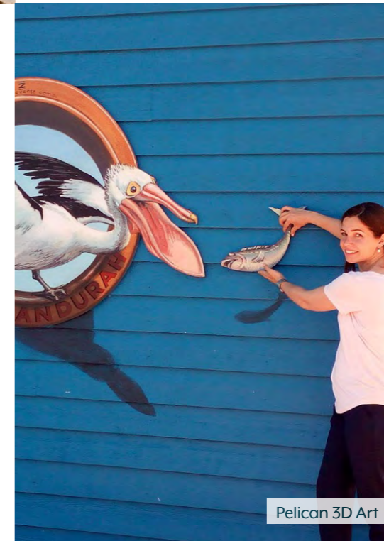
Pelican 3D Art

A popular beach with everyone from young families to groups of friends hanging out. Supervised by Surf Life Saving teams on the weekends and is the perfect place to spend some time swimming with a number of undercover shades on the sand.