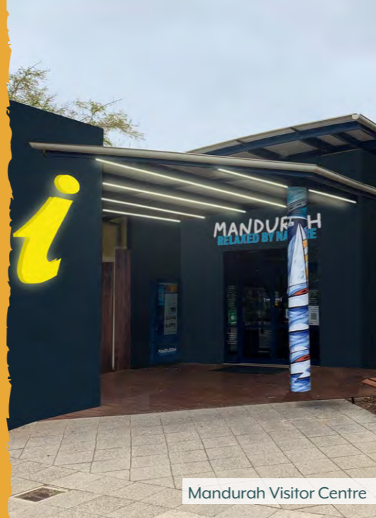
Mandurah Visitor Centre