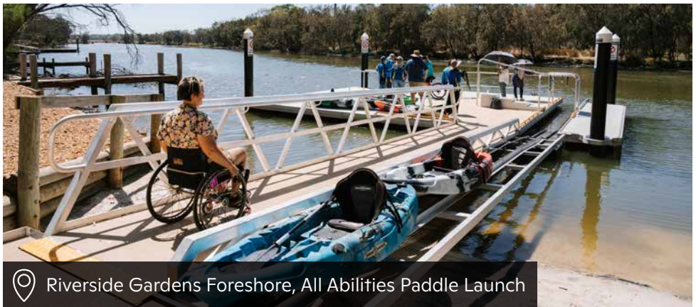
Riverside Gardens Foreshore, All Abilities Paddle Launch

E: national@masterlocksmiths.com.au | P: 1800 810 698